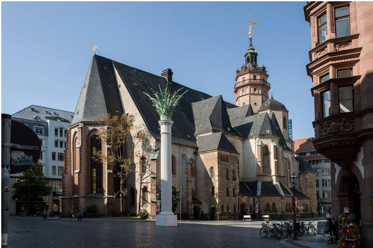
Church St. Nikolai was an important place in recent history