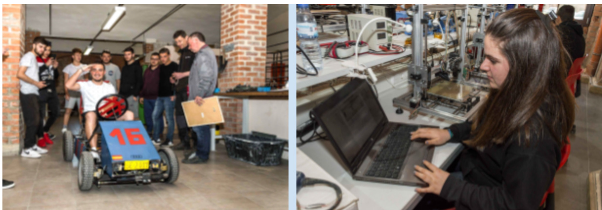
VITALIS offers internships in more than 20 different fields of study

All internships have a modular structure and are in accordance with the standards of German vocational training and ECVET principles. The modular system makes it easier to integrate the internships into the vocational education of the sending organisations. With different levels of difficulty, the internships are scalable to the knowledge of the students. An internship can be completed several times with different levels of difficulty. In this way, mobility projects with VITALIS can be planned for the long term and ensure the sustainability of learning.