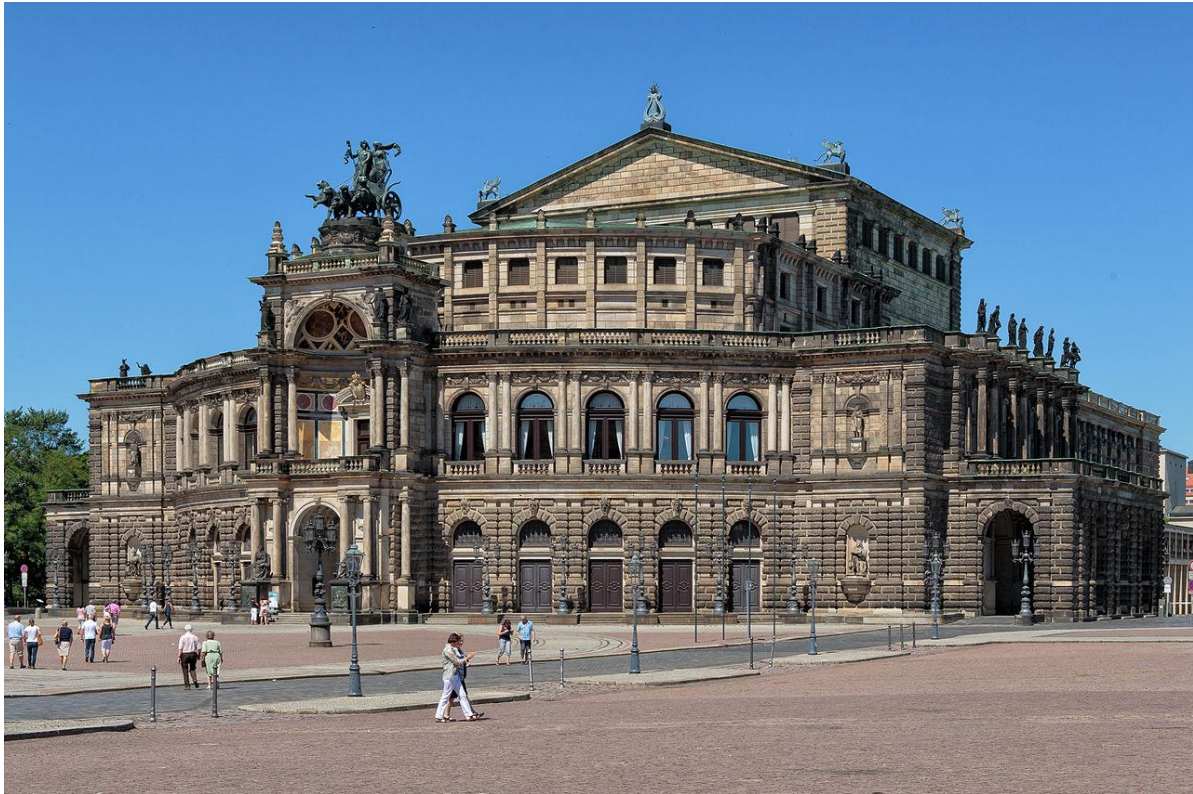
Semper Opera House in Dresden is an important landmark of history