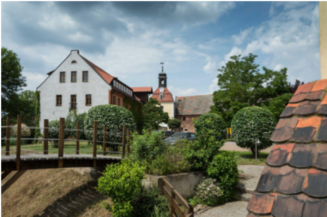
Gut Wehlitz - European center for projects in vocational training in Germany

The project focused on practical development and professional skills of the interns. Through the internships, participants combined their theoretical knowledge from school with international practical work experience in different professional fields. Soft skills and social competences were also developed. The professional, linguistic and social competences acquired in the process improve the employability of the interns on the national and international labour markets.