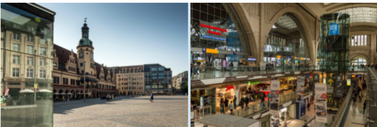
Leipzig is an old city of trade with numerous sights and a lively culture

The group completed a guided city tour of Leipzig. Leipzig has more than 1,000 years of history and is home to more than 600,000 inhabitants. It is the largest town in the Free State of Saxony and the heart of the Metropolitan Region Central Germany. With the new sites of BMW, Porsche and DHL, Leipzig has become an important and modern business location. The town was founded at the crossroad of two mediaeval trade roads, which dominated its development for centuries. Goods, people and ideas found their way to Leipzig and formed a self-confident urban citizenship.